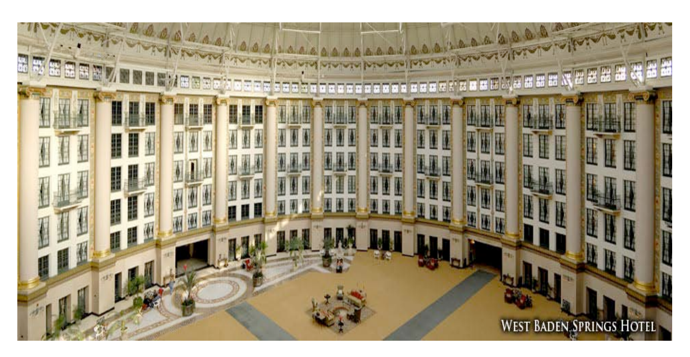
Atrium of the West Baden Springs Hotel – site of the PRMS Welcome Reception

Psychiatrists, Primary Care Physicians, Physicians of Other Specialties, Mental Health Providers, Nurse Practitioners, Physician Assistants, and Hospitalists