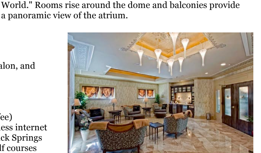
Spa at the West Baden Springs Hotel