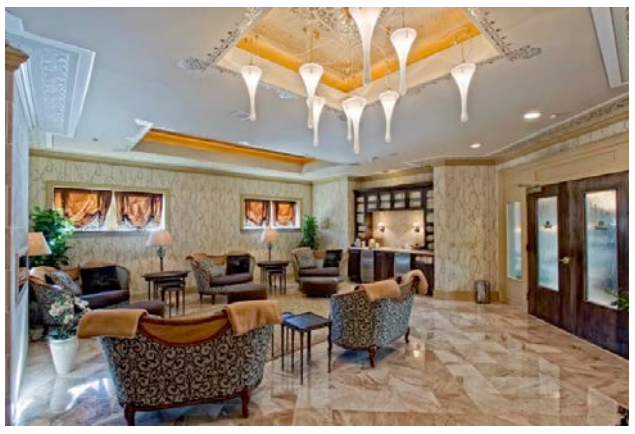
Spa at the West Baden Springs Hotel