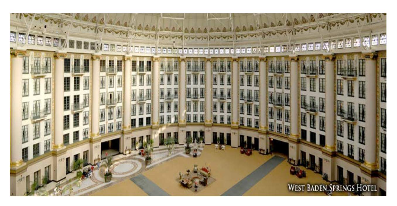
Atrium of the West Baden Springs Hotel – site of the PRMS Welcome Reception

Psychiatrists, Primary Care Physicians, Physicians of Other Specialties, Mental Health Providers, Nurse Practitioners, Physician Assistants, and Hospitalists