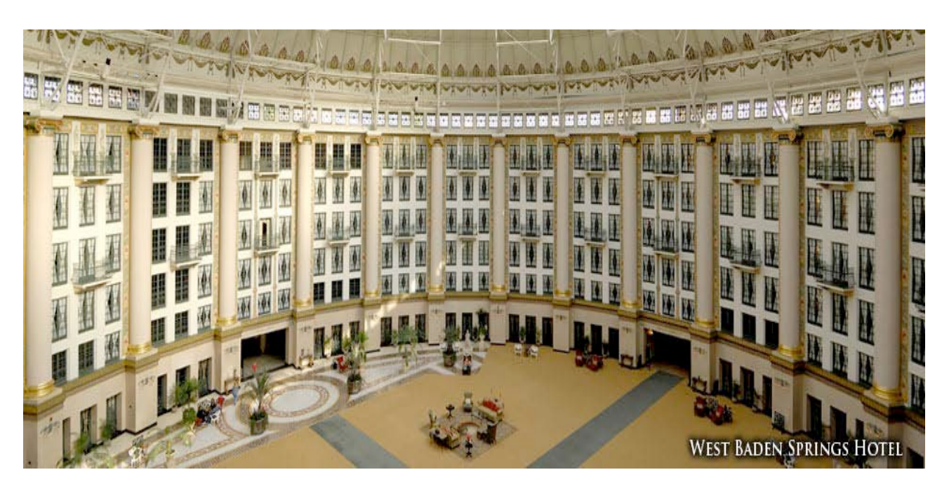
Atrium of the West Baden Springs Hotel – site of the PRMS Welcome Reception

Psychiatrists, Primary Care Physicians, Physicians of Other Specialties, Mental Health Providers, Nurse Practitioners, Physician Assistants, and Hospitalists